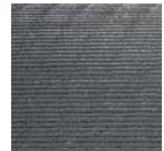
groove profile on lower side

Special dimensions are generally available on request. All BELMONDO® products are suitable for looseboxes as well as open stables.