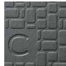
mosaic design with top coat

Surface: mosaic design with wear resistant top coat Lower side: grooves Material: rubber Thickness: 16 mm Dimensions: 1 m x 1 m Weight: approx. 18 kg Puzzle shaped edges: on 4 sides