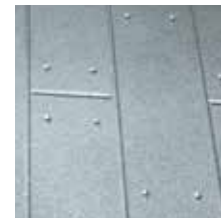
wooden planks optics