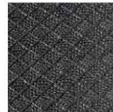
rhombic profile with top coat

Surface: rhombic profile with wear resistant top coat Lower side: studs (2 mm) Material: rubber Thickness: 19 mm Dimensions: individually tailor-made