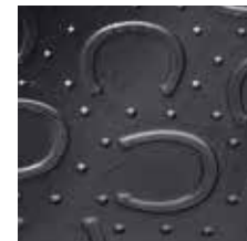
horseshoe profile with top coat